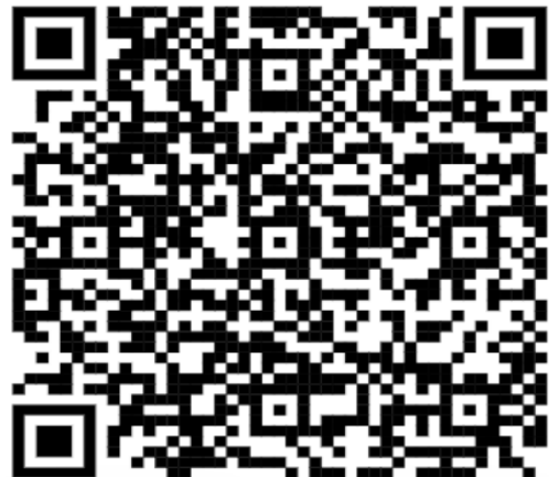
Free E-Books for Reading!